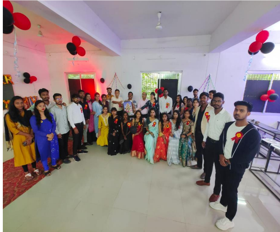
HOD Department of English

The namesake by Jhumpa Lahiri- a discussion on the namesake by Jhumpa Lahiri was organized by a student group, attended by faculty members by students from the English department. This novel, which tackles themes of identity, cultural assimilation, and the immigrant experience, provided a fertile ground for a meaningful and engaging dialog.